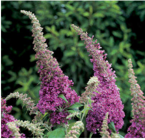
Buddleia 'Peacock' ( B. davidii 'Peakeep')

Good sized pink flower heads on a neat compact plant. First truly compact butterfly bush though long stems make a nice cut. Zone 5, 4-5 ft