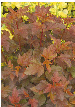
Physocarpus Coppertina™ ( P. opulifolius 'Mindia' PPAF, Candian PBRAF )

A new copper colored hybrid that resulted from a cross between Diabolo and Dart's Gold. The copper is most pronounced in the spring as the new growth flushes and then gradually changes to a dark red. This native variety has pinkish-white, button-like flowers in mid-summer. It is very showy and extremely hardy. Prized as a landscape shrub and as a cut flower. NATIVE: North America. Zone 3, 5-6 feet, Full sun