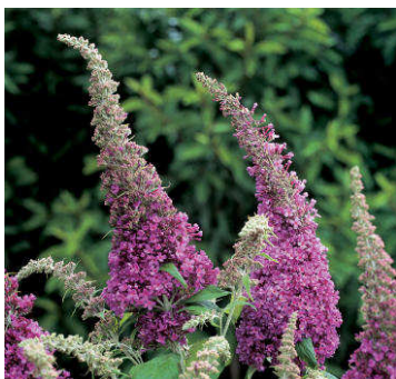
Buddleia 'Peacock' ( B. davidii 'Peakeep')

Good sized pink flower heads on a neat compact plant. Zone 5, 4-5 ft