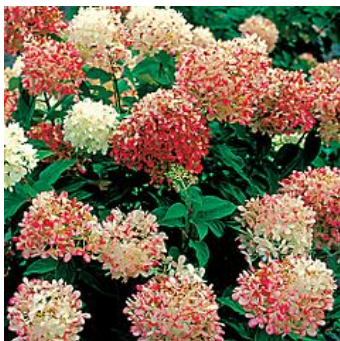
Hydrangea Limelight® PP#12,874 Botanical Name: Hydrangea paniculata Limelight As if all this flower color weren't enough, the foliage turns bright red in autumn! This new Hydrangea is so amazing that it might as well be a whole new type of shrub! Not only is it much, MUCH cold-hardier than most -- happy all the way through zone 4 in the north! -- but its blooms open green and then progress through 4 different colors! And when the flowers finally stop arriving in fall, the foliage leaps into the limelight by turning bright red! Growing Zones: 4 - 8 Sun Exposure: Part Shade to Full Sun

An exciting new and improved Ninebark with neat compact branching and fine deeply cut, dark crimson-red leaves. A heavenly hybrid which combines the fine texture and compact branching of Physocarpus 'Nana' with the dark foliage of Diabolo. It requires little pruning to make a salable plant and it presents better in a pot. This native variety has pinkish-white, button-like flowers in mid-summer. It is very showy and extremely hardy. Prized as a landscape shrub and as a cut flower. NATIVE: North America. Zone 3, 5-6 feet, Full sun