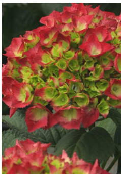
CITYLINE™ PARIS Hydrangea macrophylla 'Paris Rapa' pp#10,906

Clear Pink colored flowers are the largest in the series. The leaves are very glossy and exhibit an extremely high level of mildew resistance. Flowers are long lasting and change to an attractive green with age. The strongest growing plant in the group. Cityline Hydrangeas typically do not require much pruning but if you wish to build a tighter plant or maintain a shorter size follow these instructions: Cityline Hydrangea forms its flower buds in later summer and then flowers in late June. The best time to prune is it after it blooms, from mid-July to mid-August.