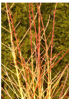
Cornus ARCTIC SUN™ ( C. sanguinea 'Cato' ppaf cbraf)

A new compact selection of the ever popular Baileyi' redstemdogwood. Dark red winter twigs and a compact, nonsuckering habit. Developed by Mike Farrow of Holly Hill Nursery. Prune immediately after flowering. Sets flower buds in summer. Do not prune in early spring or late fall. This wonderful shrub will add sensational color in the winter with its intense red stems. Bring the outdoors in and use Arctic Fire™ as a cut stem for holiday arrangements or for season long color indoors. Zone 3, 3-4 feet