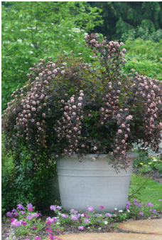
Physocarpus SUMMER WINE™ ( P. opulifolius 'Seward' PPAF)

NATIVE: North America. Zone 3, 5-6 feet, Full sun