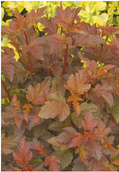
Physocarpus Coppertina™ ( P. opulifolius 'Mindia' PPAF)

Good sized pink flower heads on a neat compact plant. First truly compact butterfly bush though long stems make a nice cut. Zone 5, 4-5 ft