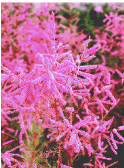
Tamarix 'Pink Cascade'

to mid-August. Cease pruning in mid-august to allow time for the flower buds to form prior to winter. NATIVE: North America. Zone 3, 5-6 feet, Full sun