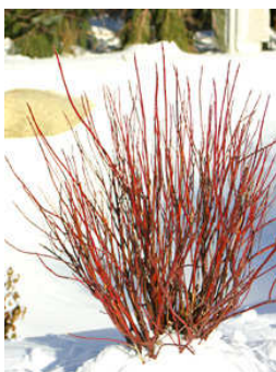
Cornus ARCTIC FIRE™ ( C. stolonifera 'Farrow' ppaf)

A new compact selection of the ever popular Baileyi' redstemdogwood. Dark red winter twigs and a compact, nonsuckering habit. Developed by Mike Farrow of Holly Hill Nursery. Prune immediately after flowering. Sets flower buds in summer. Do not prune in early spring or late fall. This wonderful shrub will add sensational color in the winter with its intense red stems. Bring the outdoors in and use Arctic Fire™ as a cut stem for holiday arrangements or for season long color indoors. Zone 3, 3-4 feet