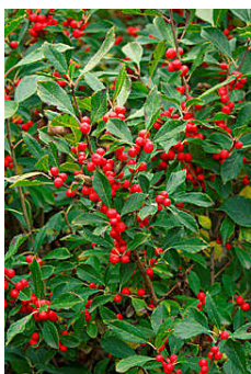
Ilex verticillata 'Jim Dandy'

The dark red berry display is so vivid, the original plant was selected by sight at a distance of 1/4 mile. It'll make you stop and take notice. Good mildew resistance. Use Jim Dandy as the male. Pruning is best if done in late fall or early spring. No Pruning really necessary unless removing dead/broken branches. Will often loose it leaves earlier than other cultivars making for a better fruit display in autumn. Produce copious amounts of bright red berries to be enjoyed in fall and winter. The berries can also be cut for use in floral arrangements. Zone 4, 6-8 feet, Cut Branch, Full Sun Partial Shade