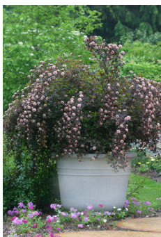
Physocarpus SUMMER WINE™ ( P. opulifolius 'Seward' PPAF, Candian PBRAF )

A new copper colored hybrid that resulted from a cross between Diabolo and Dart's Gold. The copper is most pronounced in the spring as the new growth flushes and then gradually changes to a dark red. This native variety has pinkish-white, button-like flowers in mid-summer. It is very showy and extremely hardy. Prized as a landscape shrub and as a cut flower. NATIVE: North America. Zone 3, 5-6 feet, Full sun