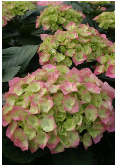
CITYLINE™ BERLIN Hydrangea macrophylla 'Berlin Rabe'

As if all this flower color weren't enough, the foliage turns bright red in autumn! This new Hydrangea is so amazing that it might as well be a whole new type of shrub! Not only is it much, MUCH cold-hardier than most -- happy all the way through zone 4 in the north! -- but its blooms open green and then progress through 4 different colors! And when the flowers finally stop arriving in fall, the foliage leaps into the limelight by turning bright red! Pruning is best if done in late fall or early spring. Blooms on new wood. Make sure to prune off spent flowers when they turn brown. Growing Zones: 4 – 8. Part Shade to Full Sun