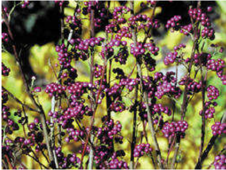
Callicarpa 'Early Amethyst' ( C. dichotoma )

Bright purple berries appear earlier than other varieties providing more enjoyment and better sales. Foliage and berries make excellent cuts From the Harvard Arnold Arboretum.